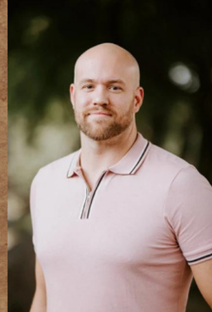
JOSEPH'S DIARY | KYLE GAZAK